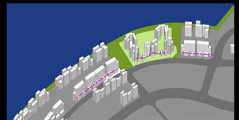
URBAN PROFILE: ESTABLISHING AN URBAN DATUM TO RELATE TO THE STREET