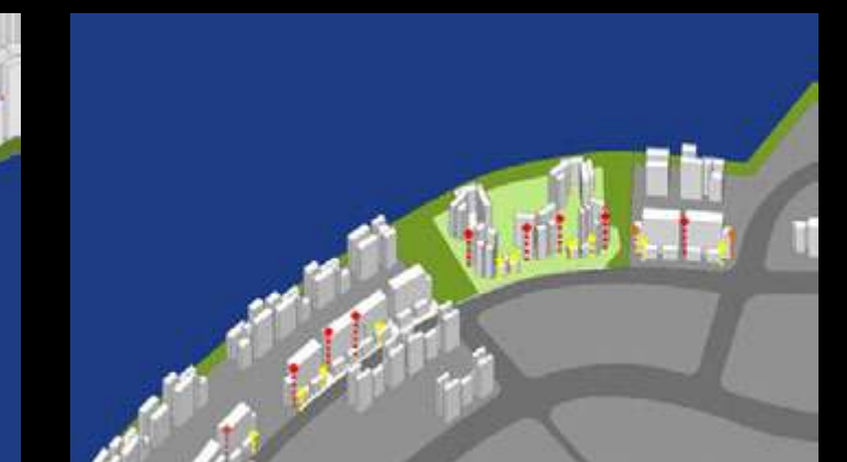
ROLLING SKYLINE: A VARIEGATED SKYLINE ALONG STREET