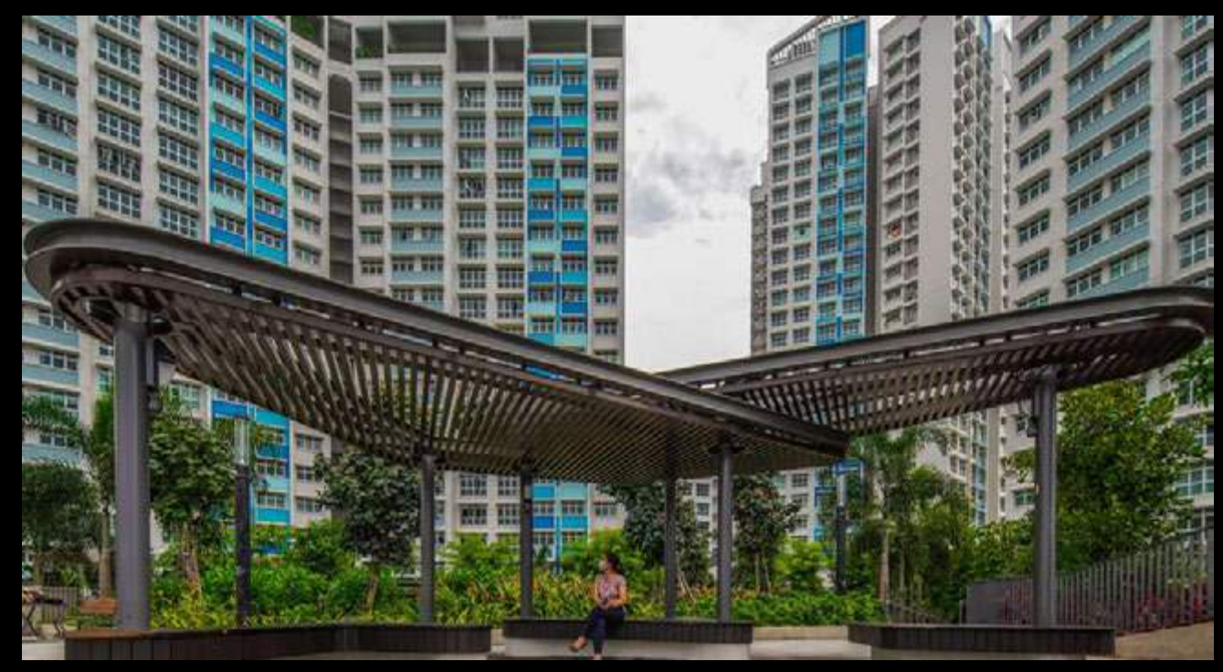
Unique trellis at e-deck