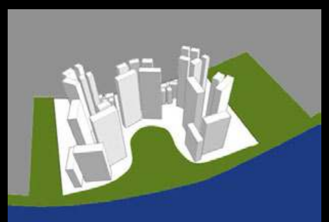
CREATION - SEMI PRIVATE ENCLOSURE