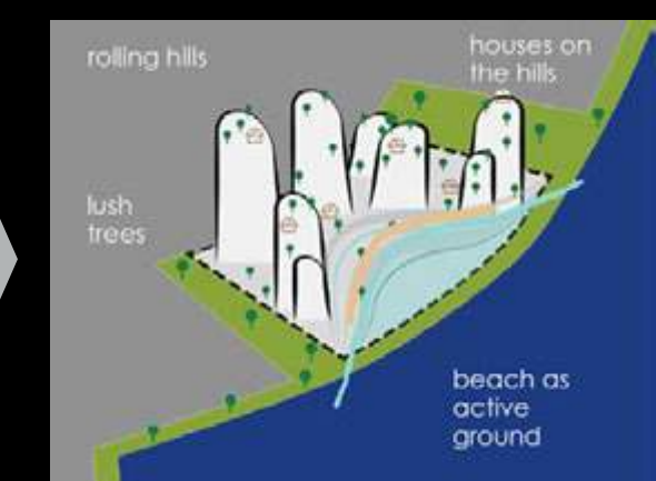
INTENTION - BRING IN THE "SEA" AND "BEACH"