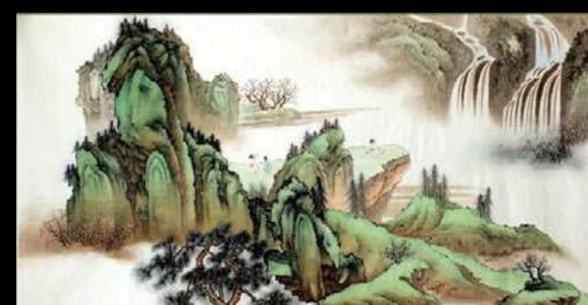
INSPIRATION - CHINESE PAINTING