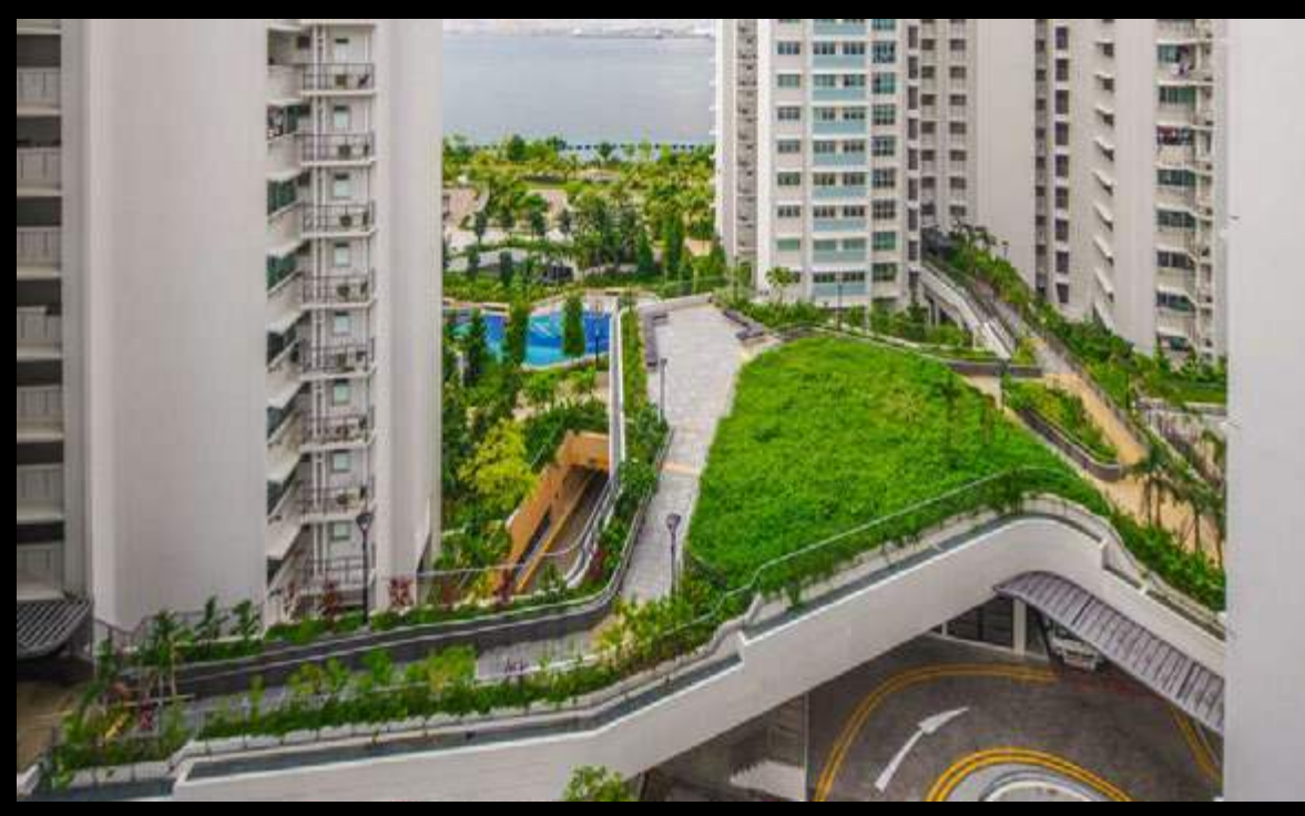
Elevated pedestrian network