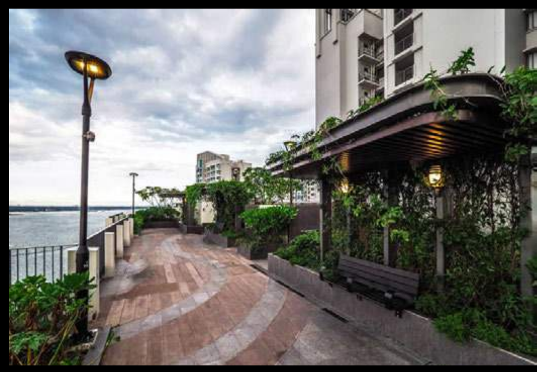
Terraced roof garden