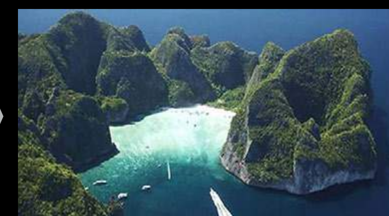
ASPIRATION - URBAN OASIS