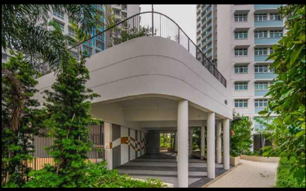
Integrated precinct pavilion