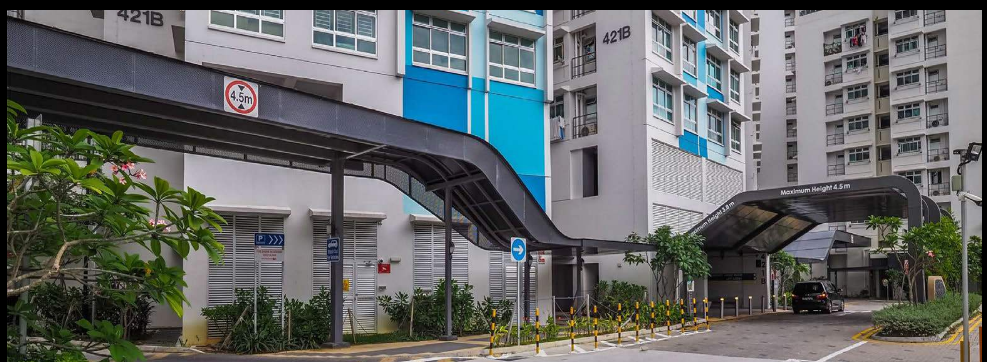
Seamless linkway and drop-off porch