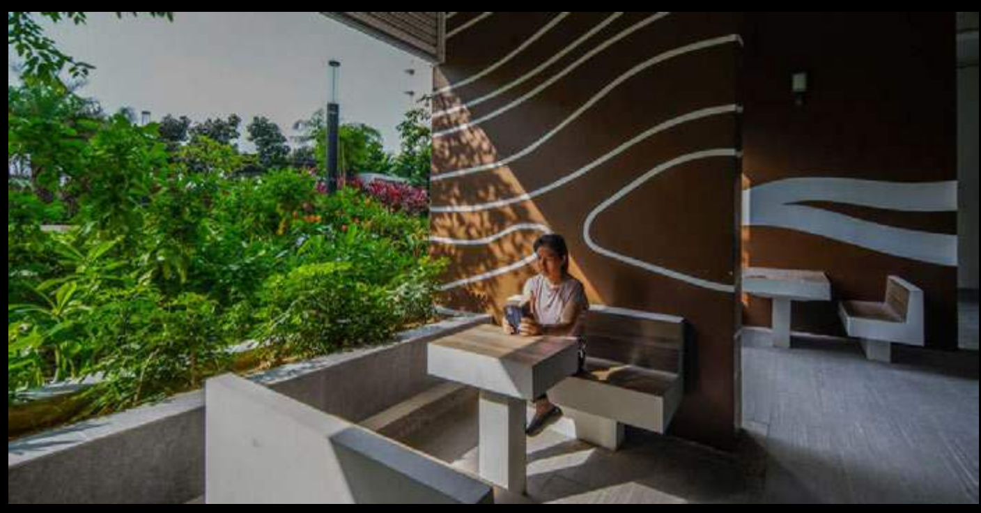
Community living room