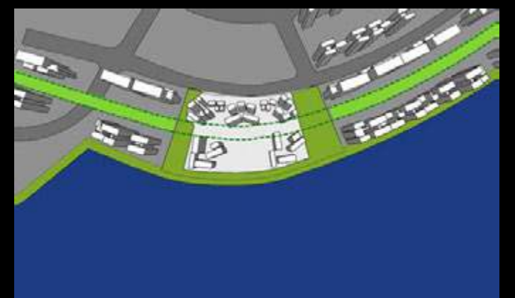
SEAMLESS GREENERY: INTERGRATING CENTRAL GREEN SPINE